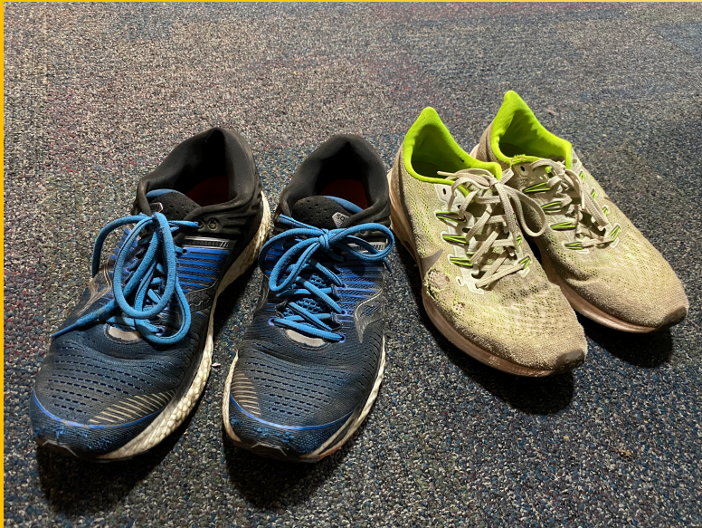
Distance Family Members Have Ran